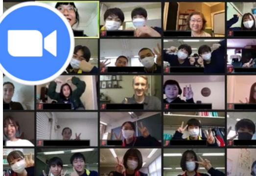
Live Video Call