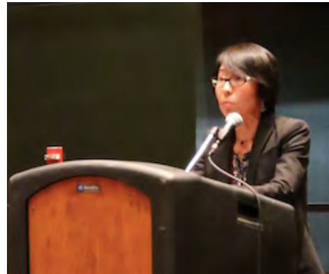
Acceptance Speech at ACTFL