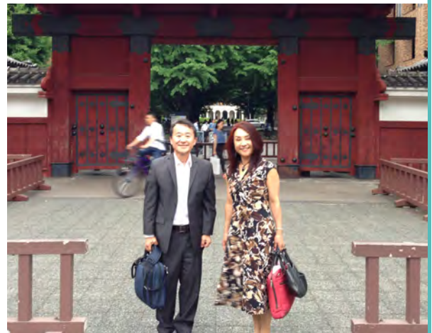
In front of the Akamon at the University of Tokyo in May 2014.