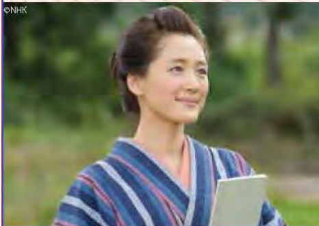
Historical Drama "Yae's Sakura" w/English sub-titles