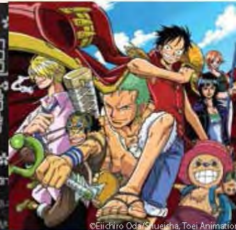
ONE PIECE Davy Back Fight w/English sub-titles