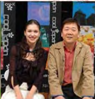
cool japan w/English sub-titles